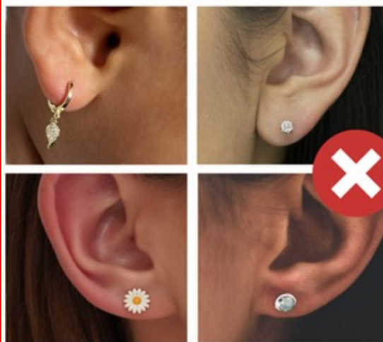
No loops, no drops, no precious (or non-precious) stones, no colours or shapes