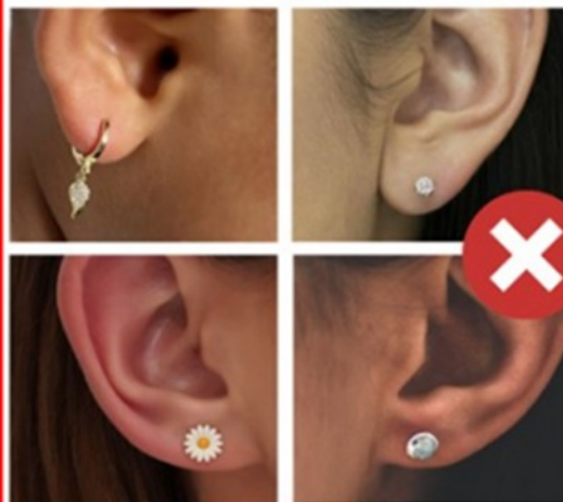
No loops, no drops, no precious (or non-precious) stones, no colours or shapes